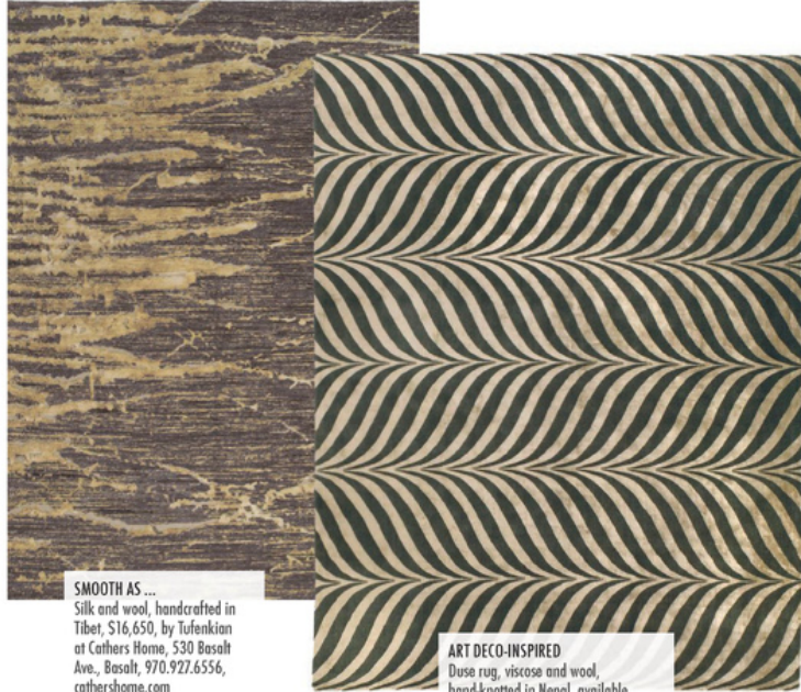
SMOOTH AS ... Silk and wool, handcrafted in Tibet, $16,650, by Tufenkian at Cathars Home, 530 Basalt Ave., Basalt, 970.927.6556, catharshome.com