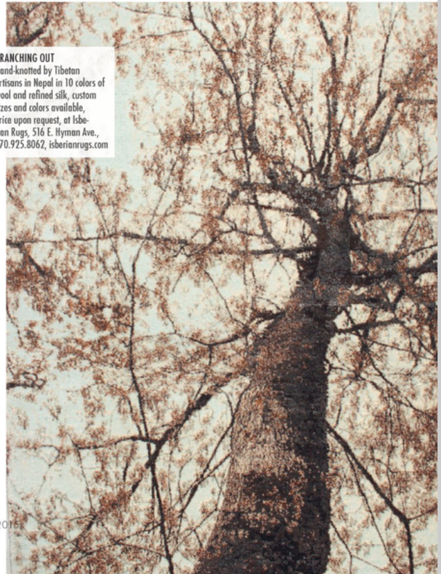
BRANCHING OUT Hand-knotted by Tibetan artisans in Nepal in 10 colors of wool and refined silk, custom sizes and colors available, price upon request, at Isberian Rugs, 516 E. Hyman Ave., 970.925.8062, isberianrugs.com