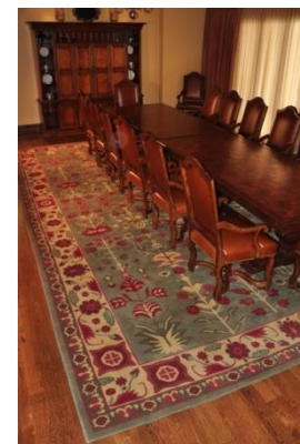
Shown above in the Broadmoor Residences Boardroom, a traditional Agra floral pattern by High Country Rugs is 60-knot Tibetan, with the photo taken 10 years after installation.