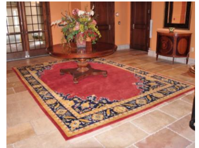
A custom recreation of an antique Sultanabad Persian floral pattern by High Country Rugs, this photo was taken 10 years after installation in the Broadmoor Residences Library.