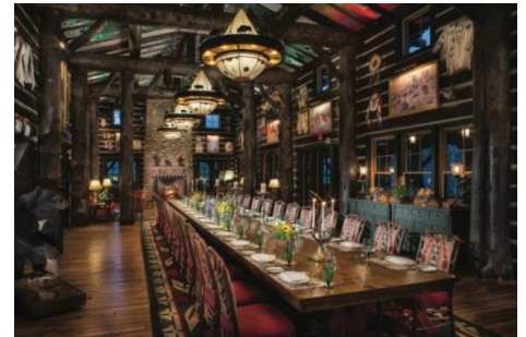
The beautiful Cloud Camp dining room features a Tibetan 80-knot Southwestern design by High Country Rugs.

With exceptional amenities like a luxurious spa, world class golf course and countless specialty tours, it is no surprise that only the best was sought out when designing and furnishing the hotel interiors.