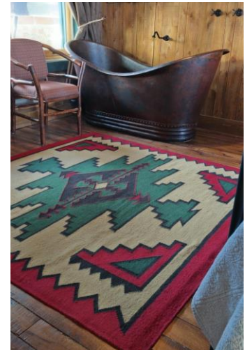
A Navajo-style flat-weave construction by High Country Rugs in one of the Broadmoor Honeymoon Suites.